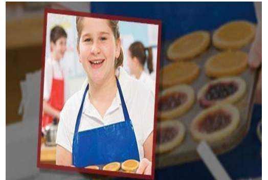
CULINARY ARTS (GRADE 8)