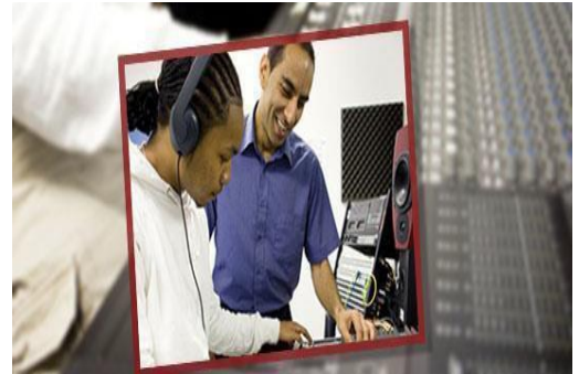
MEDIA ARTS (GRADE 6-8)