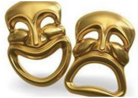
DRAMATIC ARTS (GRADES 6-8)